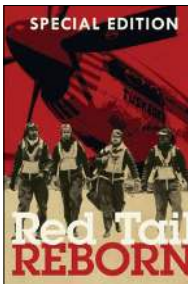
DVDs & Educational Resources