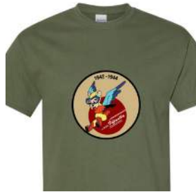
Apparel - WASP