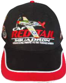
Apparel - Tuskegee Airmen

Visit our online store. Stateside shipping is included!