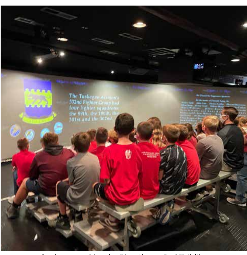
Students watching the Rise Above: Red Tail film.