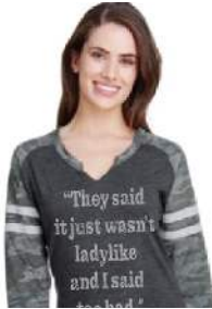
Apparel - WASP