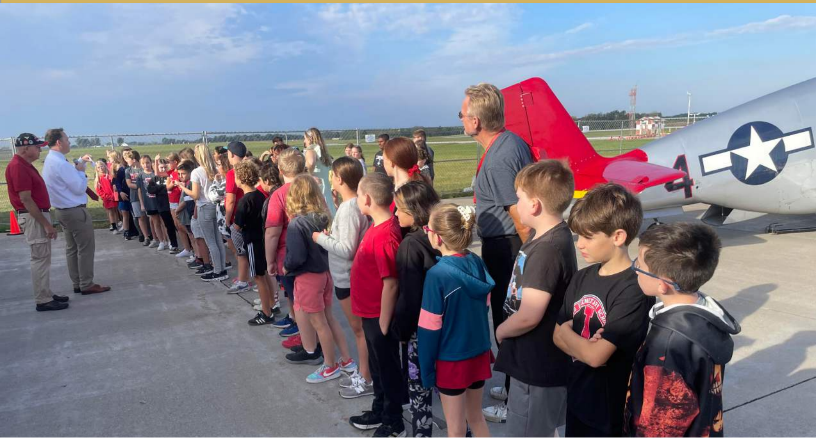
5th graders from Quincy, Illinois' Iles Elementary - the 'Red Tails!' - meet their namesake!