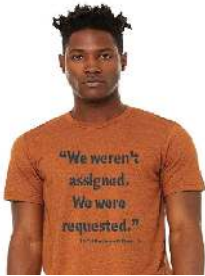
Apparel - Tuskegee Airmen

Find great treasures AND honor the history and legacy of the Tuskegee Airmen and WASP! Visit our online store. Shipping is included for state-side orders!