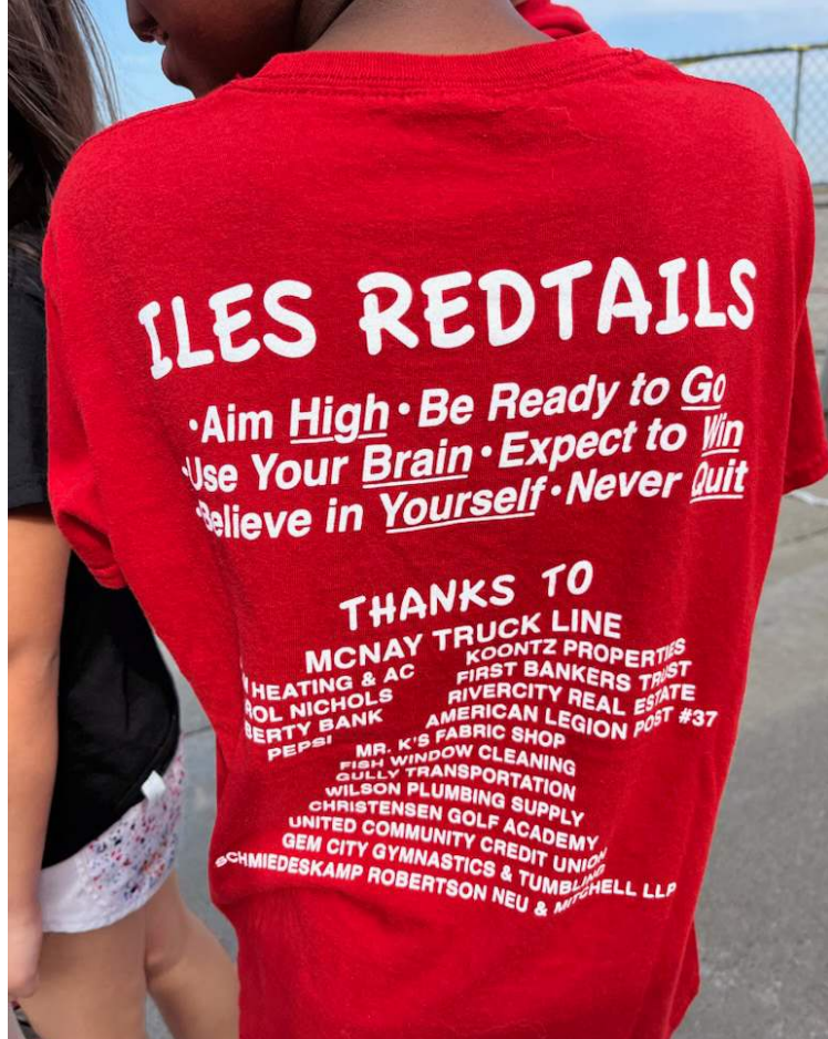
The Iles Elementary school proudly displays the Six Guiding Principles on students t-shirts and throughout the school!