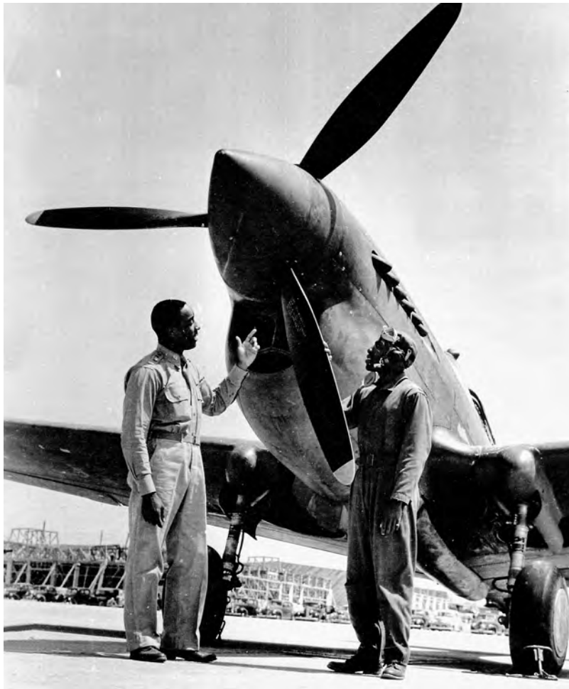
Tuskegee Airmen and a P-40, the first kind of aircraft the 99th Fighter Squadron flew in combat.

first appeared in a newspaper article in The Chicago Defender on March 24, 1945. 11 The story appeared on the first day in seven months that a 332d Fighter Group-escorted bomber was shot down by enemy aircraft. The last time that had happened was on August 24, 1944. It is possible that many of the Tuskegee Airmen who deployed to the combat theater since August did not remember seeing any bomber go down before March 24, 1945, when the claim was first published. Perhaps they were not aware of the bombers lost to enemy aircraft in June, July, and August 1944.