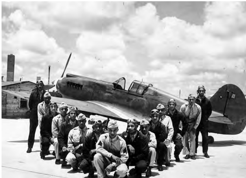
(Above) Graduating class 42F.