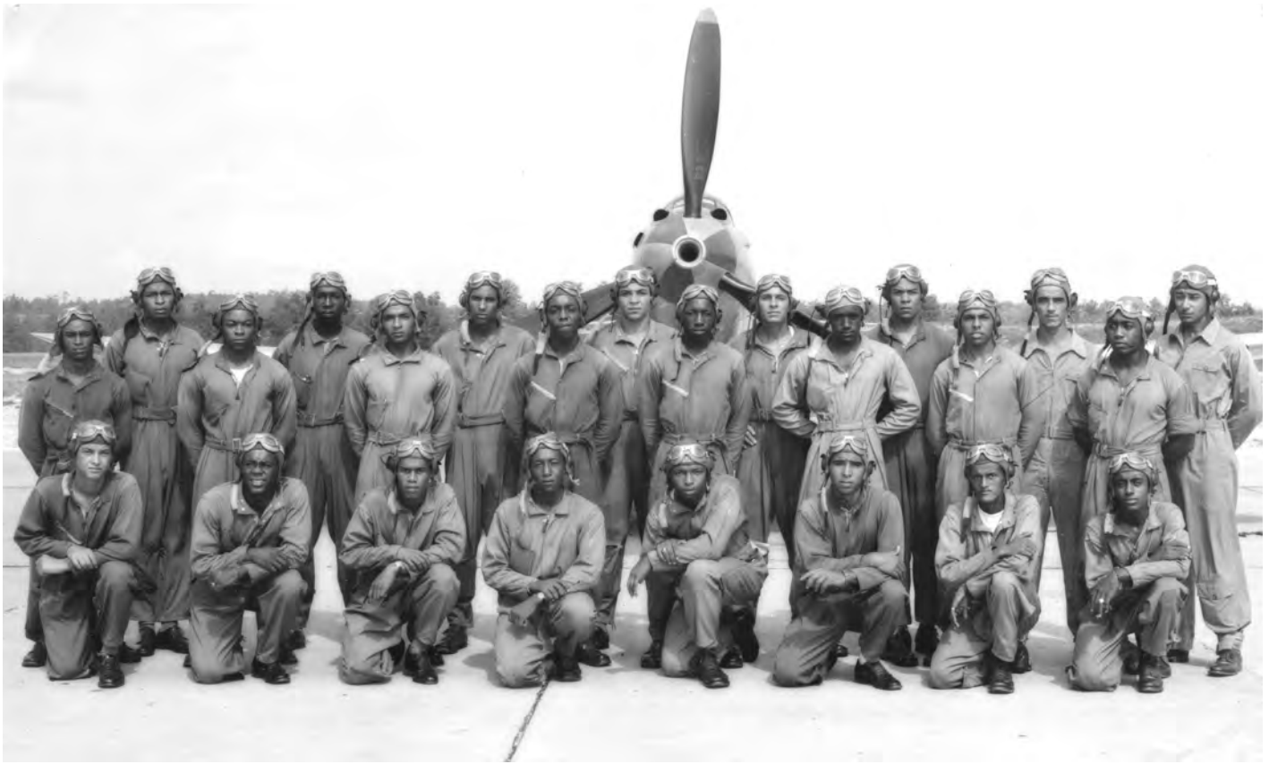
Graduating class 44H.

of the Fifteenth Air Force in 1944 and 1945 suggest that the truth lies in between. The fighter pilots of the 332d Fighter Group were not worse than the fighter pilots of the other six fighter groups in the Fifteenth Air Force, but whether the 332d Fighter Group was “better” than the other fighter groups is debatable. The aerial victory credit totals of the seven fighter groups of the Fifteenth Air Force between June 1944 and April 1945 are comparable. The 332d Fighter Group and its squadrons earned fewer credits than some of the other groups, and more than some of the others. 15 In terms of aerial victory credits, the African-American fighter pilots were roughly equal to the white ones. But considering that the starting line for the Tuskegee Airmen was farther back than for their fellow white pilots, and that they finished at roughly the same line, it is fair to conclude that the Tuskegee Airmen came farther in less time. Unquestionably, they climbed a steeper hill, because of the racial bigotry of the time.