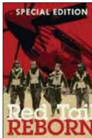
DVDs & Educational Resources