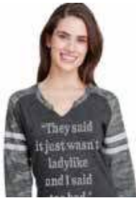
Apparel - WASP