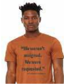
Apparel - Tuskegee Airmen

Find great treasures AND honor the history and legacy of the Tuskegee Airmen and WASP! Visit our online store. Shipping is included for state-side orders!