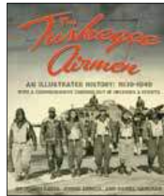
Books - Tuskegee Airmen